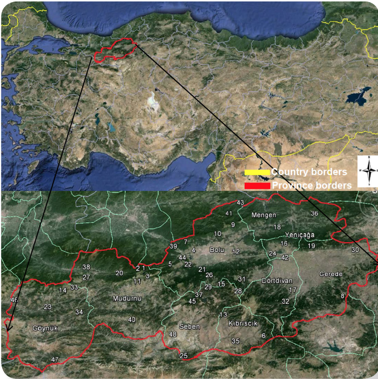
Figure 1. The geographic location of the research area.

Considering temperature and rainfall data of Bolu, two different climatic regions have been seen in Bolu, either semi arid-moist climate according to the De Martonne method or Mediterranean climate according to Emberger drought index (Akman, 2011). There is more rainfall in winter season, in spite of less rainfall in summer season in Bolu. Regarding the last decade's rainfall data, annual mean temperature in Bolu was 11.5°C. Similarly, mean maximum temperature was 29.5°C in August and mean minimum temperature was noted as 1.6°C in February. According to the temperature averages depending on the seasons, it was measured as 10.2°C in